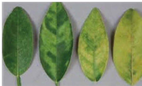
Figure 1. HLB symptoms in leaves. The irregular yellowing changes as the disease progresses.

Fruits infected with HLB may be smaller and asymmetrical and show inverse ripening (Figure 2), thickening of the pericarp (peel), and seed abortion, which decreases fruit quality and affects its flavor. The reduction of its organoleptic quality nullifies fruit trade in the industry (Bove, 2006). This disease also causes premature leaf drop, fruit abortion, and, in advanced stages, the death of the citrus tree (Wang et al. , 2017).