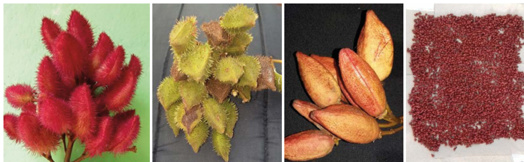
Figure 1. Annatto samples and seeds collected in two communities in Cunduacán, Tabasco.

placed in paper bags with a capacity of 500 g and labeled; each sample weighed approximately 200 g. These were taken to the Campus Tabasco del Colegio de Postgraduados where they were analyzed in the Animal Science Laboratory and Central Laboratory.