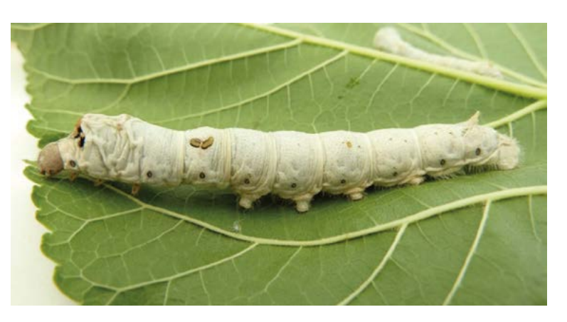
Figure 1. Larva of Bombyx mori L. kinshu×showa hybrid / Chinese×Japanese race.

into five groups. Group 1 was fed with fresh mulberry leaves every day, during the fifth instar, and was considered as the control. Group 2 was fed with mulberry leaves dipped in milk every day, during the fifth instar (Treatment 1: V instar - TD). Group 3 was fed with mulberry leaves dipped in milk on alternate days (1, 3, and 5) of the fifth instar (Treatment 2: V instar - DI); whereas, on days 2, 4, and 6, they were fed with fresh mulberry leaves. Group 4 was fed with mulberry leaves dipped in milk every day, during the fourth and fifth instar (Treatment 3: IV and V instar - TD). Group 5 was fed with mulberry leaves dipped in milk on alternate days (1, 3, and 5) from the fourth to the fifth instar (Treatment 4: IV and V instar - DI); whereas, on days 2, 4, and 6, they were fed with fresh mulberry leaves. Weights were recorded from day 1 to 5. A completely randomized design was used, with three replicates per treatment (with n=50 larvae each). ANOVA assumptions were verified individually for each variable. The independence of experimental errors was ensured through the random assignment of populations to each experimental unit. The assumption of normal distribution was analyzed using the Shapiro-Wilk test. The statistical software used was SPSS v. 25. The "F" value was considered significant at a 0.05 probability level and Tukey's multiple comparison test was performed at 5%.