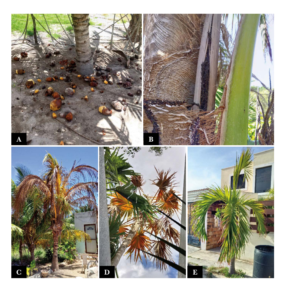
Figure 3 . Symptoms induced by subgroup 16SrIV-A phytoplasmas (associated with LY) in Cocos nucifera and two other palms. A. Premature fruit drop in C. nucifera . B. Blackening of new inflorescences in the same species. C. Progressive (uppwards) leaf yellowing in C. nucifera . D. Leaf yellowing in Thrinax radiata . E. First stage of foliar decay in Adonidia merrillii .

protocols, it is important to keep in mind that, prior to the late 1980s, phytoplasmas were differentiated only by some of their biological properties such as host range, geographic distribution, and the symptoms induced in affected plants, thus, LY reports before that period, including those cited in this article, should be regarded as plausible, but not unequivocal evidence of subgroup 16SrIV-A's involvement. Also, it should be noted that LY was not always referred to as such. Previous names applied to this disease in the first half of the 20<sup>th</sup> century included "fever", "bud rot", and "West End bud rot" (Smith, 1905; Johnston, 1912; Ashby, 1915). Other authors used the terms "bronze leaf wilt" (Martyn, 1945) and "unknown disease" (Leach, 1946), to avoid confusion with the "common" bud rot caused by Phytophtora palmivora (Butler) Butler.