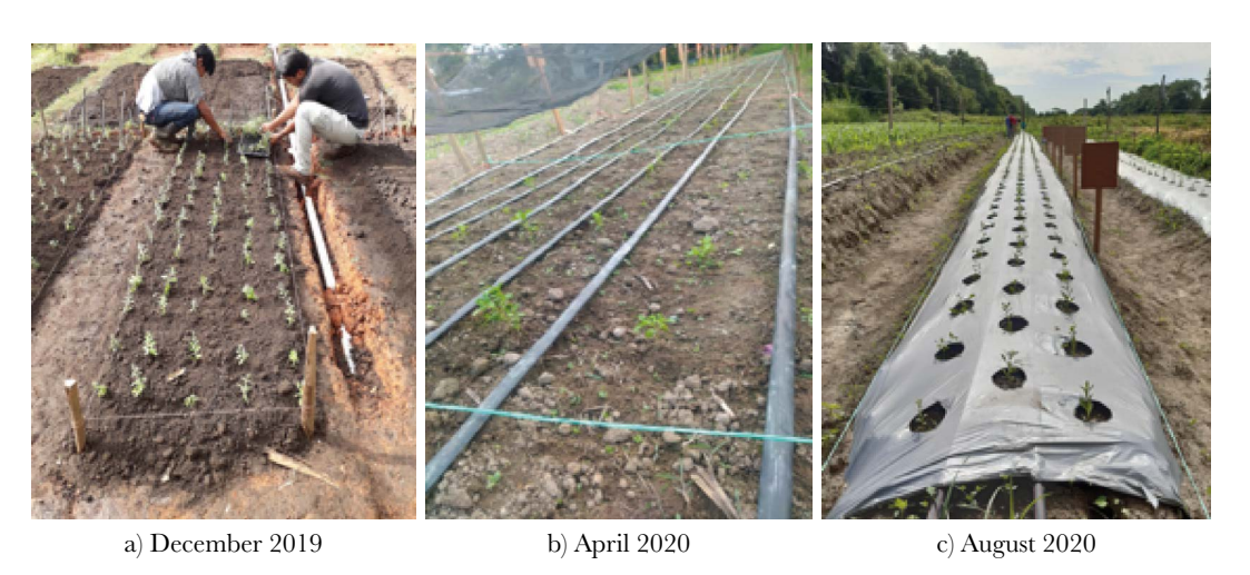
Figure 1 . a) Manual preparation of planting beds, irrigation, and manual weeding; b) Soil and mechanized preparation of planting beds, drip irrigation system; and c) manual preparation of planting beds, drip irrigation, silver plastic mulch.

HOBO Data Logger. The monthly precipitation was 36.3 mm, 281.7 mm, and 385.7 mm in the said months, according to the Comisión Nacional del Agua (CONAGUA, 2020). The cultivation area has a soil with a clayey texture, with an OM of 2.3%, pH of 7.9, and an EC of 0.47 dS/cm.