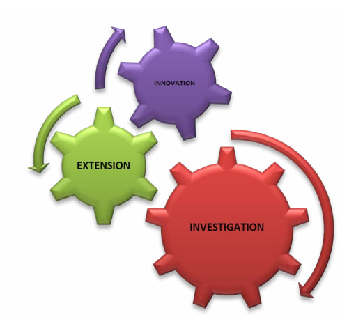
Figure 1. Elements that make up the development strategy of PRODETER.

The Secretaria de Agricultura y Desarrollo Rural (Secretary of Agriculture and Rural Development) defined territorial development as an action where two segments converge: infrastructure investment and knowledge investment. so that farmers, producers, and ranchers (for this document, using any of the three concepts will be considered as synonymous among each other, and differentiates ranchers given the activity they develop)