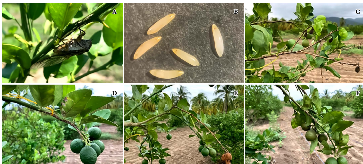
Figure 1. Female cicada of D. bulgara in Mexican lime plant (A), eggs (B) and damage caused in terminal flows and lime fruits as result of the oviposition of eggs (C-F). Río Grande, Villa de Tututepec, Oaxaca, June 2020.

Table 1 presents the percentage of incidence of citrus trees affected by D. bulgara . The incidence of damage was quantified from 78.6 to 94%, based on the number of trees from each cultivar.