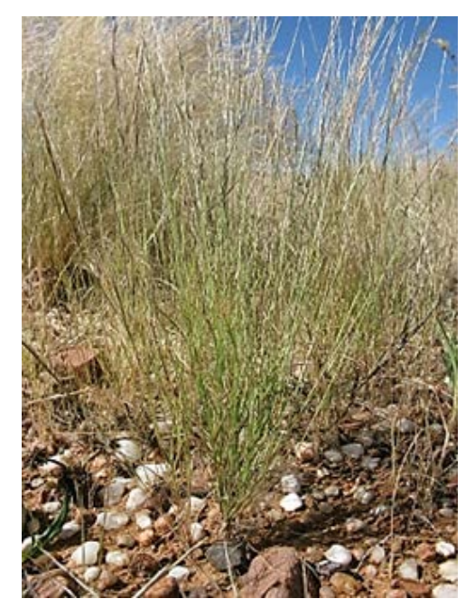
Figure 3 . Zacate tres barbas ( Aristida adscensionis ), the most important species in the diet of the bighorn sheep at the UMA Rancho Noche Buena, Hermosillo, Sonora, Mexico.