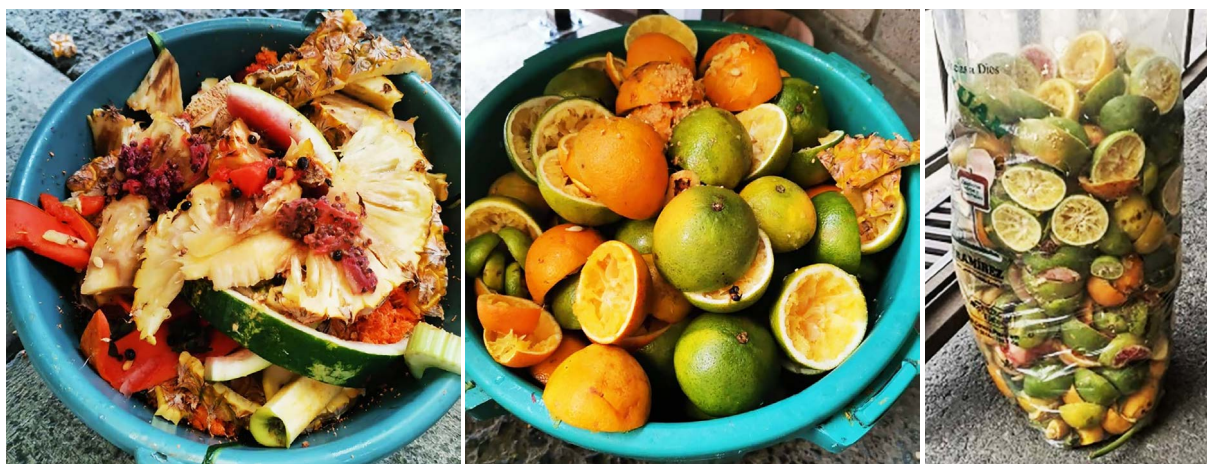
Figure 1. Fruit and vegetable waste generated in the commercial establishment “Sandwichon” in Pachuca, Hidalgo, Mexico.

Orange peel was the most abundant waste during the collection period (Figures 1 and 2), representing 75% of the total waste (351 kg from Monday to Saturday for four