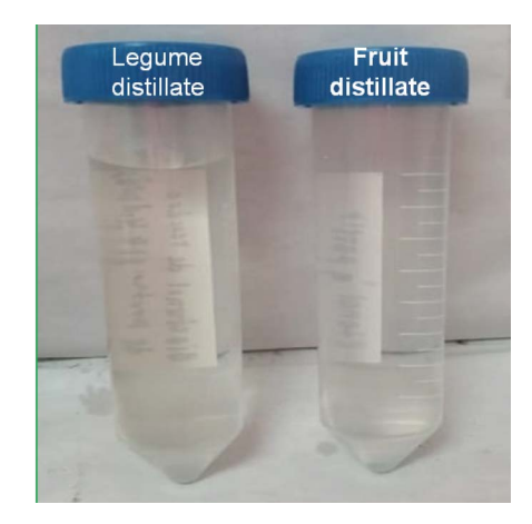
Figure 4. Distillates obtained from the agri-food waste.

to a circular economy of the food industry. In this way, the amount of waste generated at the University, which is generally destined for inadequate final disposal, was reduced.