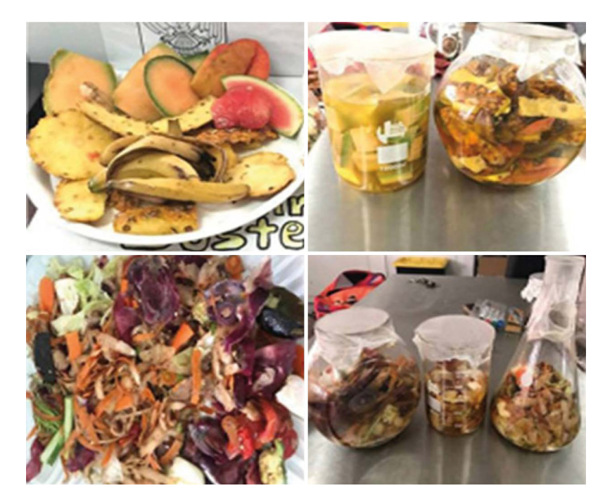
Figure 2. Mechanical and chemical treatment of agri-food waste.

Table 3 shows the characteristics of the obtained organic fractions from each of the mixtures after treatment with acid hydrolysis. The density value for the fruit mixture was 1.03 g/mL and 9.86 °Brix, values close to those reported for mandarin peel hydrolysates 1.15 g/mL and 14 °Brix (Llenque-Díaz et al. , 2020). A hydrolysate with a 1.0144 g/mL density and 4.140 °Brix was obtained from the legumes mixture. Brix degrees are the percentage of soluble solids present in some substances. For fruits, the value indicates the